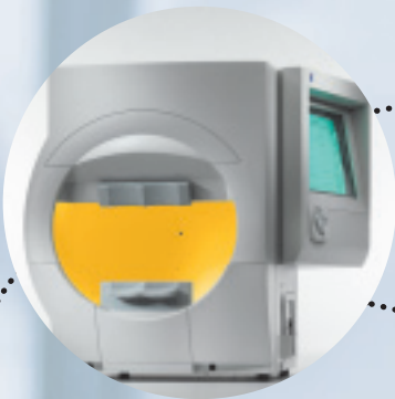
Humphrey® Field Analyzer/HFA II-i