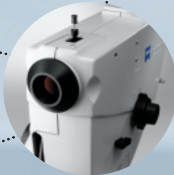
FF 450 plus Fundus Cameras